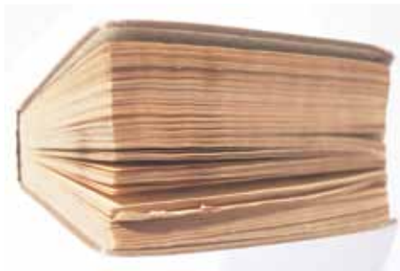
Bad faith in Florida: go to the statutes

QBE Ins. Co. v. Chalfonte Condominium Apartment Assoc. involved a coverage dispute under a property insurance policy. The insured contended that QBE’s investigation and processing of the claim had been so dilatory as to constitute a breach of the covenant of good faith and fair dealing that is implied into every contract by Florida’s common law. The insured also asserted that the policy’s hurricane deductible was invalid, because its type size and terminology allegedly violated a Florida notice statute. On an appeal from a judgment that awarded