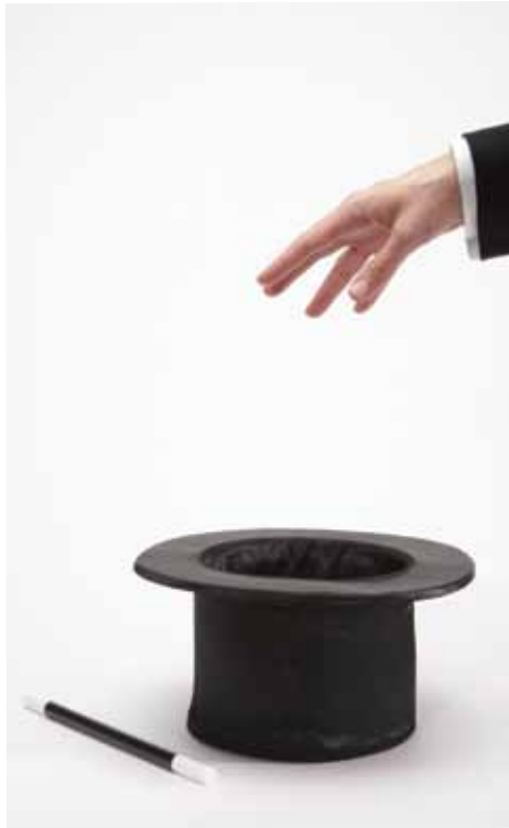
The disappearance of proposed rule 2211 is a mystery

Enter the Dodd-Frank Act of 2010. In particular, Section 916 of Dodd-Frank, together with certain implementing rules that the SEC has adopted, establishes strict new time deadlines applicable to the SEC’s publication, review, and approval/disapproval of proposed FINRA rule changes. Any forthcoming proposal along the lines of FINRA Rule 2211 would be subject to these new time deadlines, which are intended to prevent proposals from being hung up without final action as in this case.