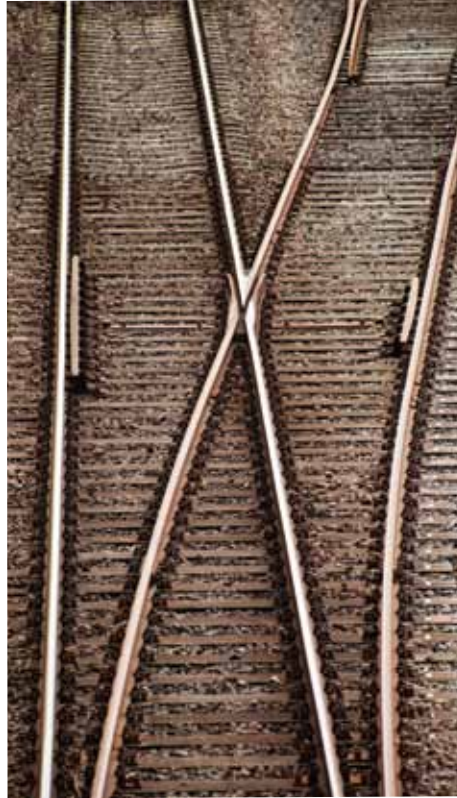
IAIS: Systemic risk for insurers who "significantly deviate" from traditional model

The IAIS has recognized that "traditional insurance" generally neither generates nor amplifies systemic risk within the financial system, but that there is a potential for systemic risk in insurance companies when