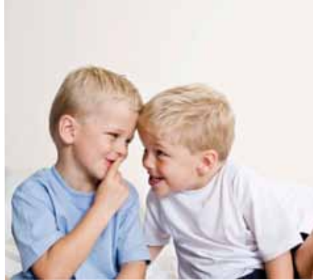
Helping one client at the expense of another, a no-no

The Hedge Fund had purchased $10 million of illiquid bonds issued by Hong Kong-based Jackin International. The Hedge Fund got into trouble during the financial crisis when it faced an increase in redemption requests from investors, while, simultaneously, Jackin became unable to service the bonds. To alleviate the Hedge Fund's problem, Martin Currie steered the China Fund to invest $22.8 million in bonds issued by a Jackin subsidiary,