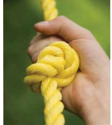
NAIC trying to come to grips with insurers' transfer of risk

In January 2012 the Subgroup issued a Request for Comment to the 50 states and the District of Columbia covering a number of questions relating to the regulation and use of captives and special purpose vehicles. The results from the 31 responding regulators are available on the NAIC website. The Subgroup has prepared a corresponding Request for Comment aimed at individual insurance companies addressing their use of captives and special purpose vehicles. The Subgroup's work plan also includes the drafting of a White Paper on captives and special purpose vehicles, with exposure targeted for late July 2012.