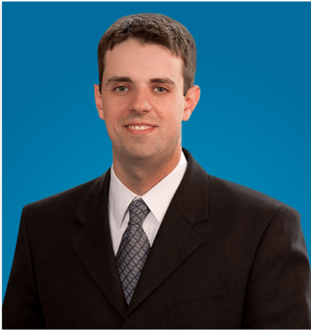
Christopher M. Paolini