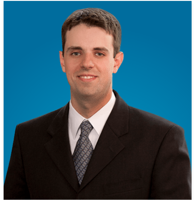
Christopher M. Paolini